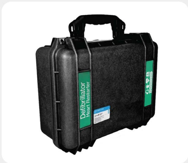
IP67 Thermal Protected Hard Case