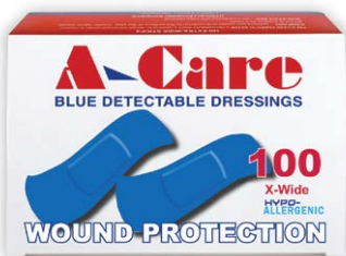
AC100 – X-Wide (Box 100)