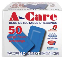
AC101 – Large Patch (Box 50)