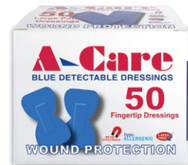
AC102 – Fingertip (Box 50)