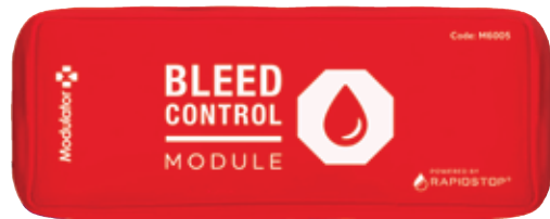
BLEED CONTROL MODULE REFILL* Code: M6005 Case Included