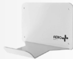
Item: Metal Wall Bracket Code: MWB01

This sturdy metal wall bracket keeps your backpack visible and ready for emergencies.