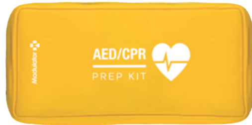
AED / CPR PREP MODULE Code: M6010 Case Included